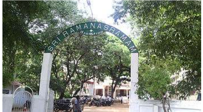
Ramana Maharishi Ashram