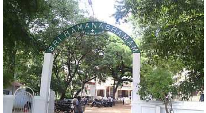
Ramana Maharishi Ashram